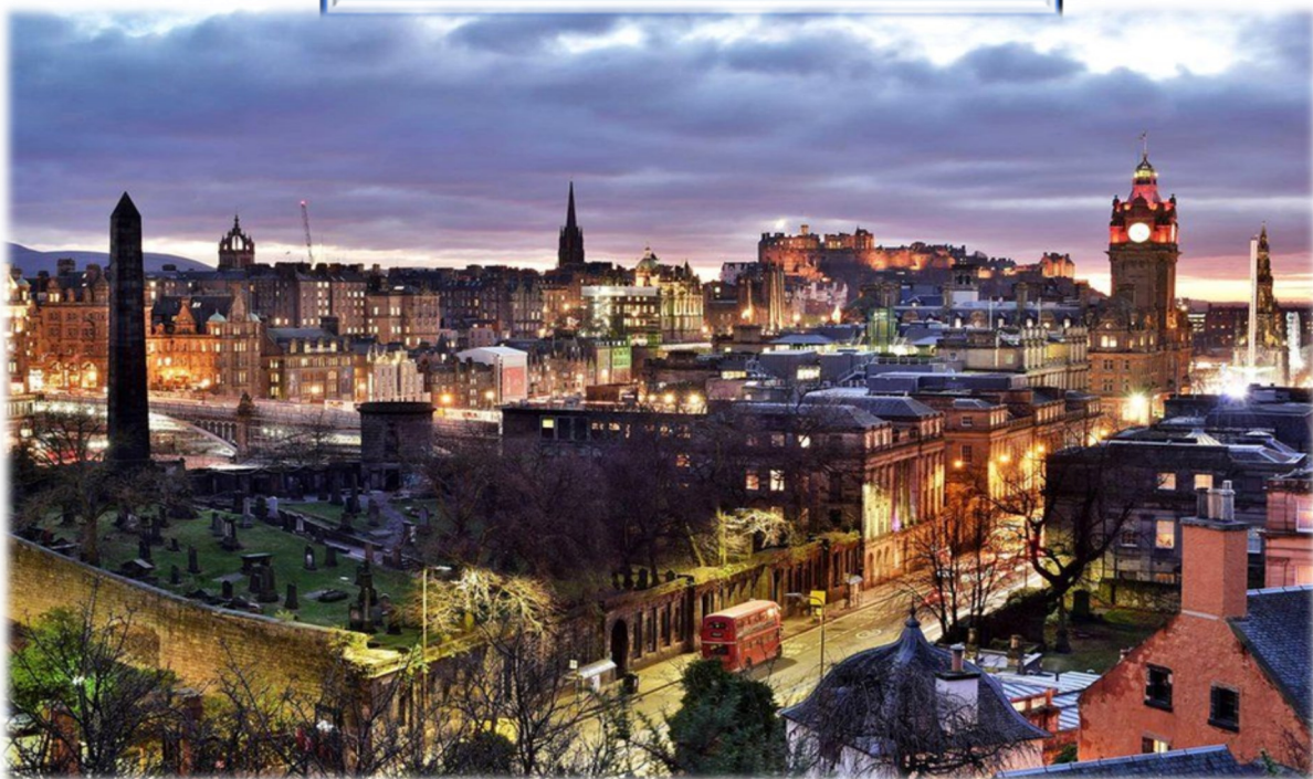
Carlton Hill, Edinburgh